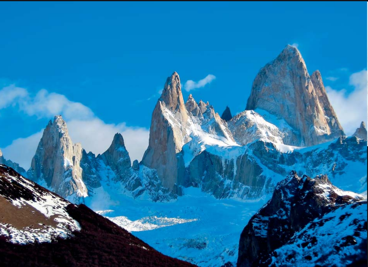
Fitz Roy massif - Cerro Fitz Roy, Aguja Poincenot, Aguja Saing Exuperi, Argentina