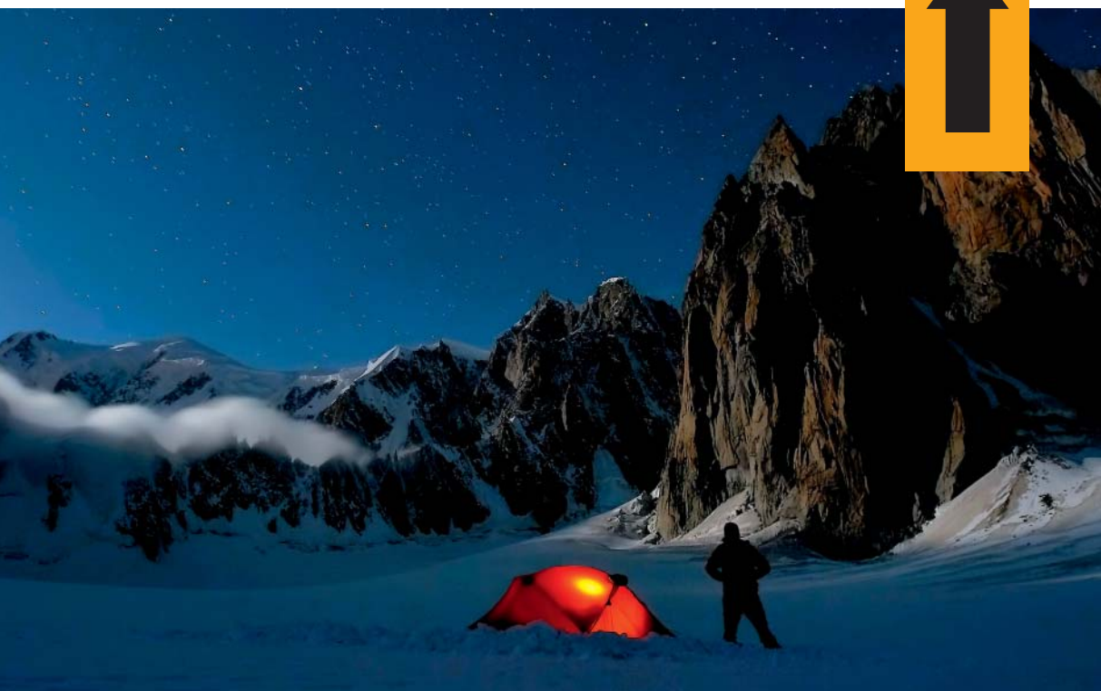
Base Camp, south-east face Grand Capucin, Mont-Blanc, France