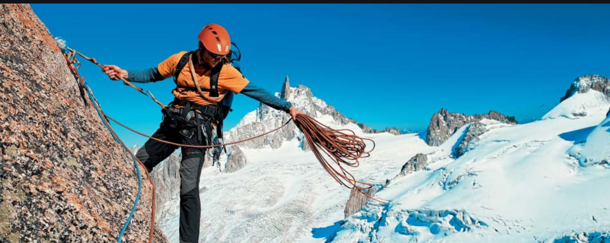
Grand Capucin, Swiss route 6bAD, Mont-Blanc, France