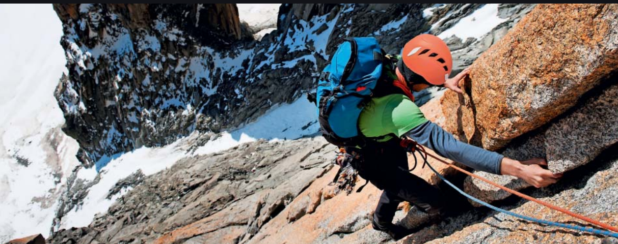
Grand Capucin, Swiss route 6bAD, Mont-Blanc, France